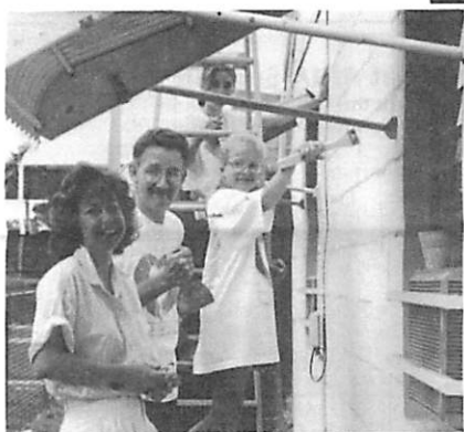
OPTION Care families work together in many ways.