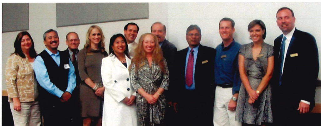
FMA President presents the newly installed LCMS 2012 Officers