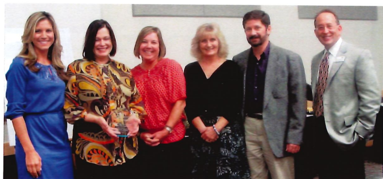
The Non-Physician Award of Appreciation was presented to the SPCU-Gulf Coast Hospital RN Staff.