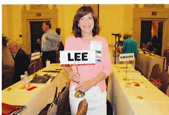
FMA ALLIANCE DELEGATE